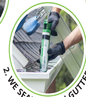
2. WE SEAL + ALIGN GUTTERS