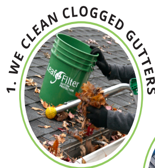
1. WE CLEAN CLOGGED GUTTERS