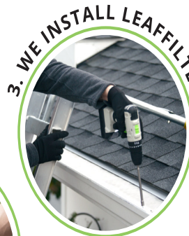
3. WE INSTALL LEAFFILTER

20% OFF + 10% OFF Your Entire Purchase* Seniors + Military