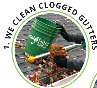
1. WE CLEAN CLOGGED GUTTERS