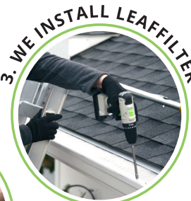
3. WE INSTALL LEAFILTER