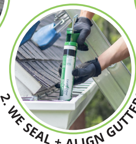
2. WE SEAL + ALIGN GUTTERS