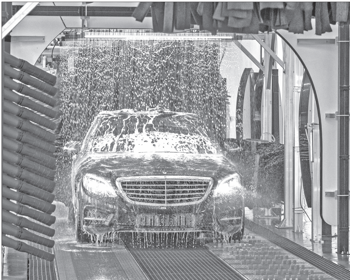
Vehicles are now cleaned with the latest automation and advanced technology as the legendary Rossmoor Car Wash has been transformed into the Clean Wave Express at its former location at Katella Avenue and Los Alamitos Boulevard.

“Well, it is not impossible, and our investment is really paying off as we continue to dial everything in,” said Hooper, noting that the new facility’s layered, Ceramic X-3 fusion wash process is the lat-