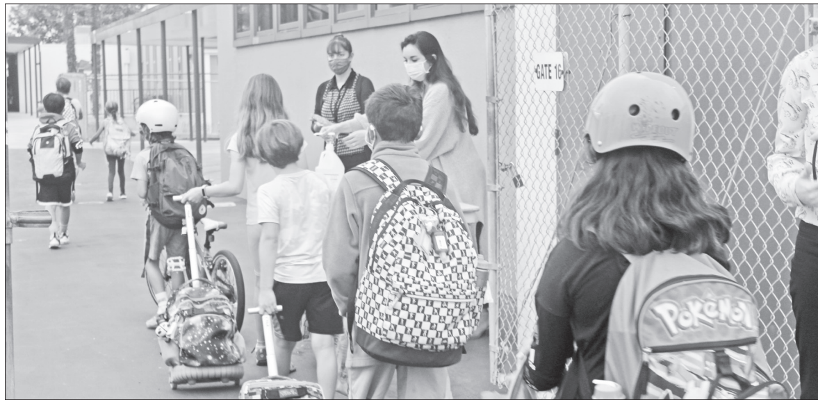
Students at J.H. McGaugh Elementary school in Seal Beach waited in line to get hand sanitizer before entering classrooms on Tuesday, Sept. 8, 2020, the first day of in-person classes on campus.